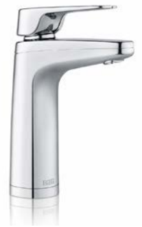
XL Levered dispenser